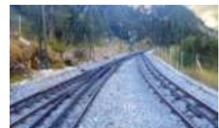
Figure 3 Abt rack switching, Vale de Núria Railway, Spain (Cooper 2014)

Abt saw limitations in the Riggenbach rack system, as being expensive to manufacture and maintain and having complex switching arrangements. While in Paris, he designed and patented his own rack-railway system in 1882. His system used two or three solid rack blades with vertical off-set teeth centrally located between the outer adhesion rails. This system ensured the pinions on the locomotive driving wheels were constantly engaged with the rack. Abt considered the twin blade version was adequate, less costly to manufacture and easier to maintain. It also offered a system that accommodated points transitions on rack-operated sidings (see Figure 3), allowed the use of smaller track radii and then with an 1886 patent provided a spring-loaded transition that provided a smoother entry for an adhesion to rack/adhesion rail operation. Both these latter items were used on Mt. Lyell's Abt Railway. Abt also developed the self-regulating 'Abt Switch' for funicular railways and led the construction of 72 mountain railways worldwide.